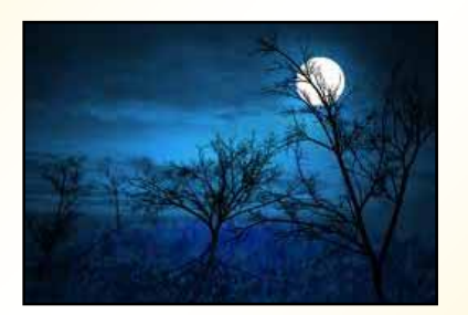
June 1, 2012 6:00 p.m.

The Bassoon Quartet and The Epiphany Dance Company