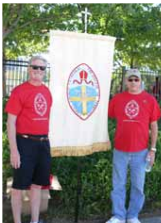
Join us for the Nashville CARES AIDS Walk