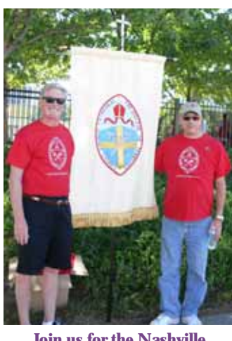
Join us for the Nashville CARES AIDS Walk

Park. Check-in for the Walk and Run begins at 10 a.m., with the three-mile Walk and Run beginning at 11 a.m. We would love for you to join the Christ Church Cathedral Team and be part of our effort to recruit at least 50 walkers and raise at least $10,000 to support the Nashville CARES mission. Go to christcathedral.org/walk. There you can join the team, sponsor one of the walkers listed on the Christ Church Cathedral team page on the website, or make a general team donation. You can enter