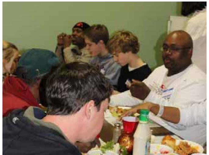
ROOM IN THE INN