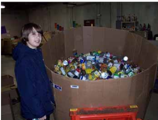
SECOND HARVEST FOOD BANK