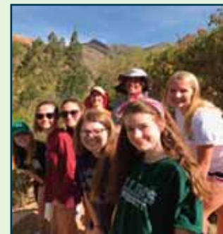
Amistad Mission, Bolivia 2017