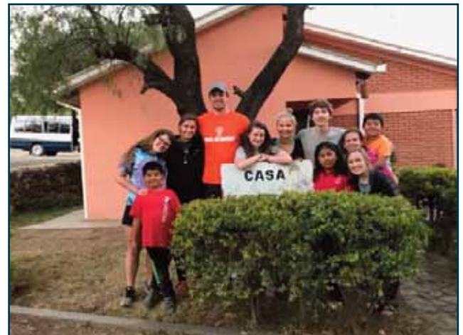
Our youth and the children of Kantuta House in Amistad Mission, Bolivia.