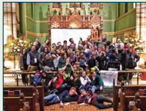
Discovery Weekend 2018!