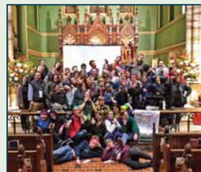
Discovery Weekend 2018!

Registration opens February 1 for both mission opportunities.