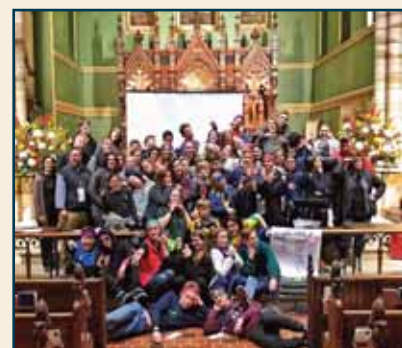
Discovery Weekend 2018!