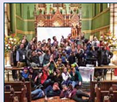
Discovery Weekend 2018!