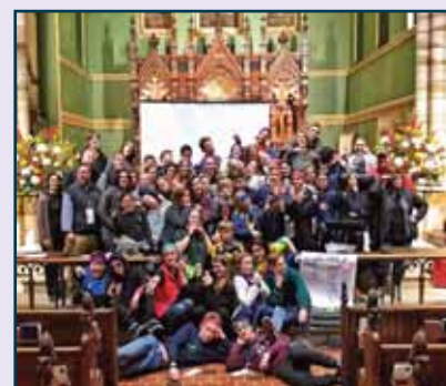
Discovery Weekend 2018!