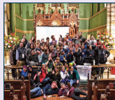
Discovery Weekend 2018!