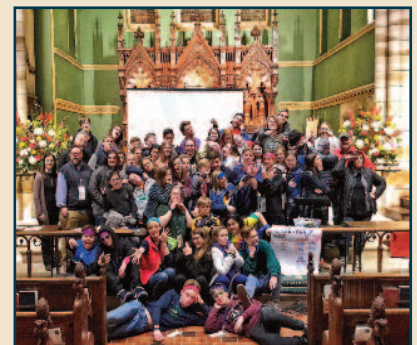
Discovery Weekend 2018!