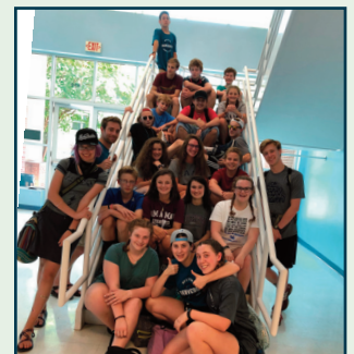
Urban Mission Memphis