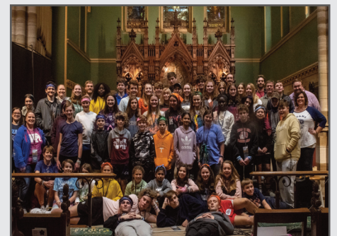
Discovery Weekend 2020