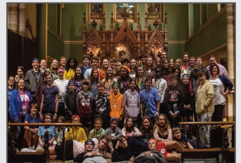
Discovery Weekend 2020