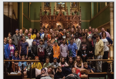
Discovery Weekend 2020