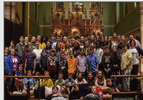
Discovery Weekend 2020