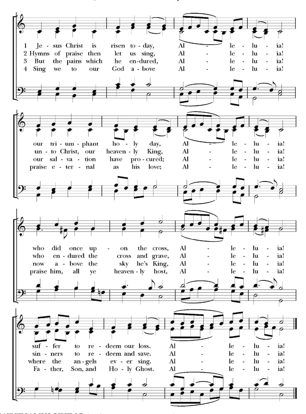
THE GREAT THANKSGIVING (Eucharistic Prayer B, p. 367)

CelebrantThe Lord be with you.PeopleAnd also with you.CelebrantLift up your hearts.